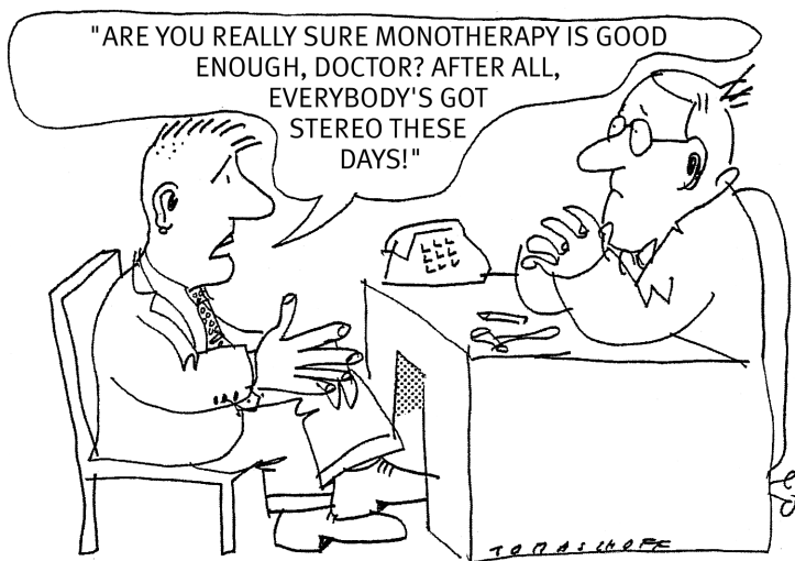
Fig. 9: “Monotherapy”